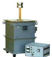
KV100-100 100kV 100mA

High voltage test systems are also available from T&R Test Equipment up to 100kV 100mA.