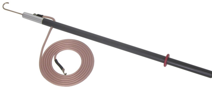
ES30 Earthing stick

If you require a different output voltage test system, please contact us with your specification and we will quote for a custom design.